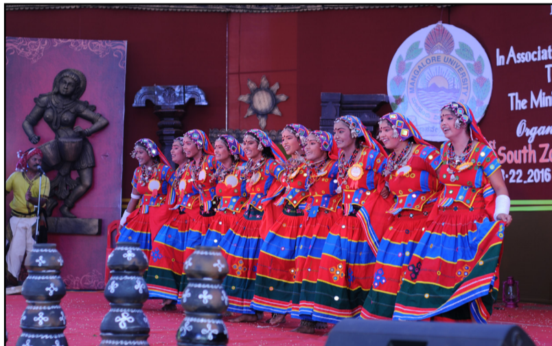
Students performing Banjara Dance

Skit and one act play was held at Dr. Shivarama Karantha vedike and a total of 18 teams presented skits on