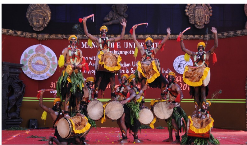
Dollu Kunitha folk dance