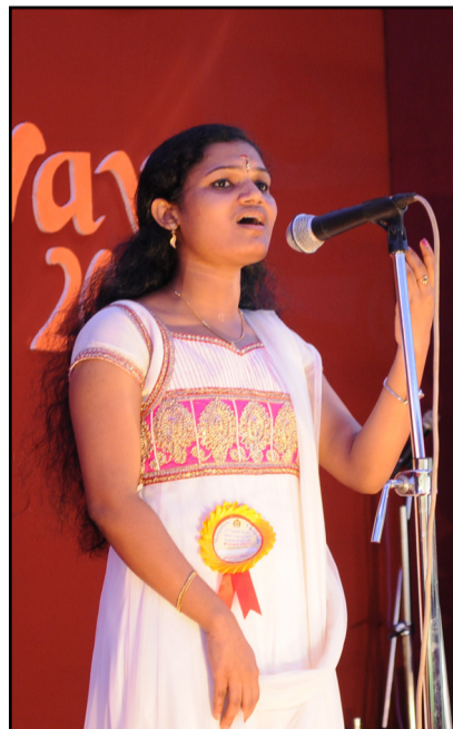
Light Vocal Indian music (solo)