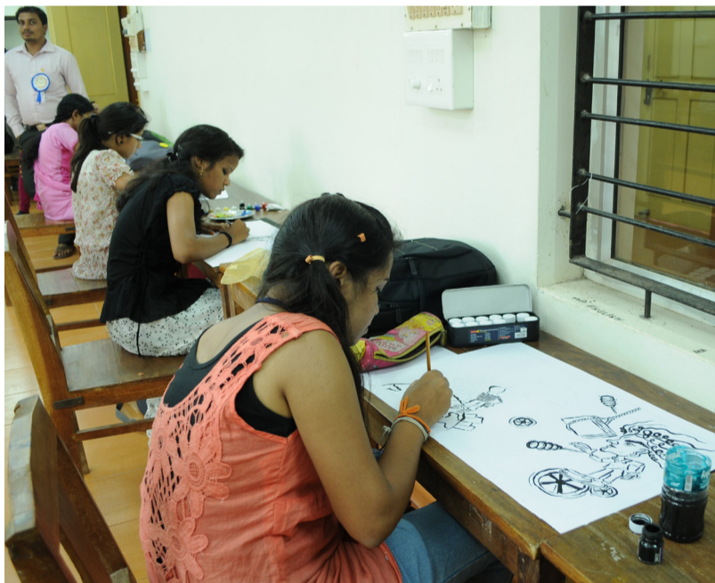
Communicating through cartoons