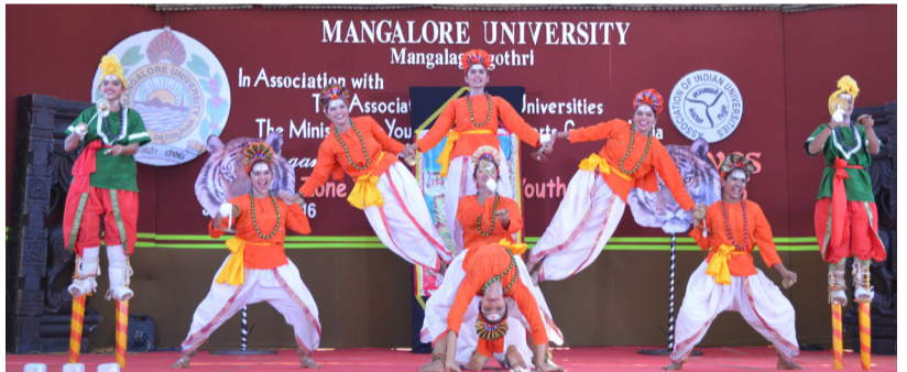
Kamsale folk dance